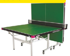
Table Tennis Table £372.00 Product Code: D46144