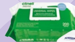
49092X Clinell Universal Sanitising Wipes