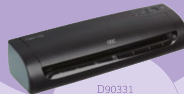
D90331 Gbc Fusion 1100L A3 Pouch Laminator