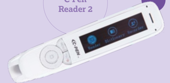
306931 C Pen Reader 2