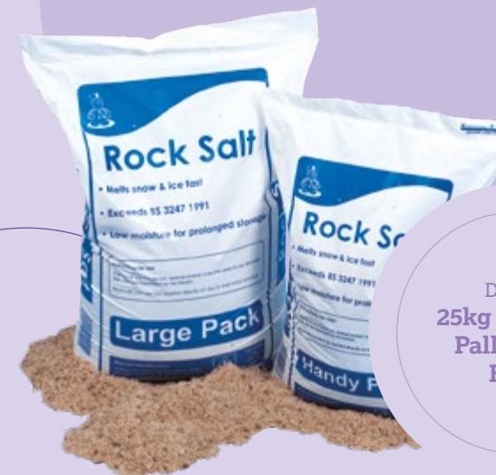
D62487 25kg Rocksalt Pallet of 40 Bags