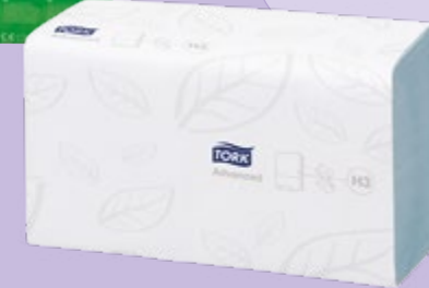
217654 Tork Singlefold Hand Towel 2Ply Blue