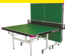
Table Tennis Table £364.50 Product Code: D46144